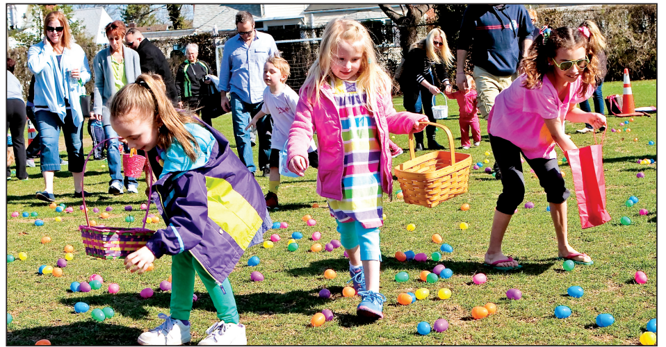
Join the Recreation Center for its annual Easter Egg Hunt on Saturday, March 28 at 9:30 a.m. at the Recreation Center's Veterans Park.

DETAILED INFORMATION FOR ALL ACTIVITIES CAN BE FOUND AT THE RECREATION CENTER OFFICE, ON THE RECREATION CENTER'S NEW WEBSITE AT WWW.RVCREC.WEBLY.COM , OR BY CALLING THE RECREATION CENTER AT 678-9238.